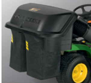
Material Collection Systems for most John Deere Lawn Tractors and Ztraks

Contact your Green Diamond Equipment for pricing on specific models