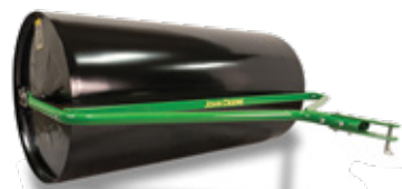
Steel Lawn Roller 24 x 48" LP64738 $559 99