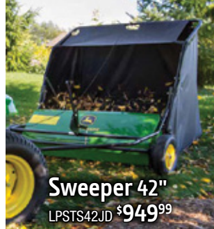
Sweeper 42" LPSTS42JD $949 99