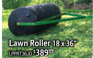
Lawn Roller 18 x 36" LPPRT36JD $389 99