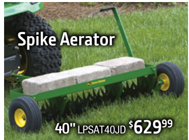
Spike Aerator 40" LPSAT40JD $629 99