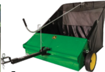
Sweeper 44" LP49038 $699 99