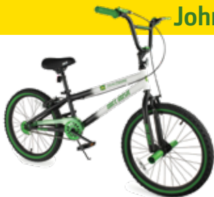
John Deere Pedal Bikes starting at $149 99

Kids 12 Volt Gator XUV with Trailer For 2 riders LP49518 $629 99