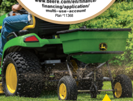
Spin Spreader LP25353 Pull 125lb $599 99 LP25354 Pull 175 lb $699 99