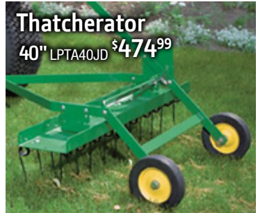
Thatcherator 40" LPTA40JD $474 99

Contact your Green Diamond Equipment for pricing on specific models