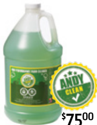
High Performance Foam Cleaner 3.78 Liter PMH4300 $75 00