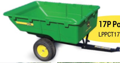
17P Poly Cart LPPCT17JD $849 99