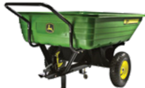
8Y Poly Cart LP22755 $434 99