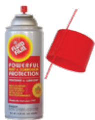
Fluid Film #3300 $14 99