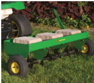
Plug Aerator 40" LPPA40JD $949 99