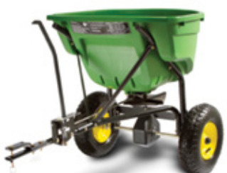
Tow Behind Spreader 40" LP39087 130 lb $364 99