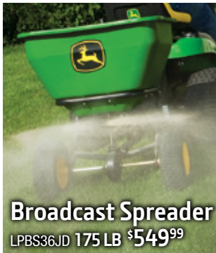
Broadcast Spreader LPBS36JD 175 LB $549 99