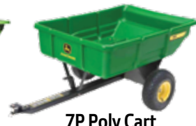
7P Poly Cart LP21935 $449 99