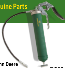
John Deere Grease Gun TY26517 $59 99