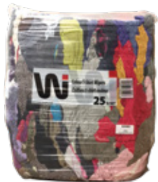
Bag of Rags 25 lbs BX-25C $29 99