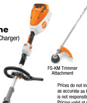
FS-KM Trimmer Attachment

Versatile, Powerful, and Quiet for All Your Yard Needs