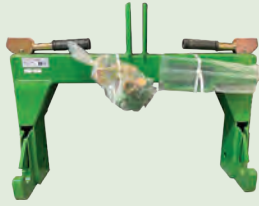
Quick Hitch #QHIG $399 99 Compatible with 1, 2, 3 and 4 Series