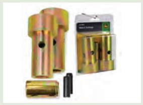
iMatch Bushing Kit LP19969 $74 75 1 Series