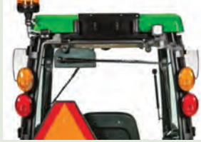
Rear Wiper Kit BLV11241 $588 25 1 Series