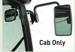
External Mirror Kit LVB24844 $372 50 3R Series