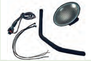
Single Rear Auxiliary Work Light LVB25547 $116 40 1, and 3E Series