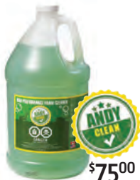
High Performance Foam Cleaner 3.78 Liter PMH4300 $75 00