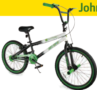
John Deere Pedal Bikes starting at $149 99

Kids 12 Volt Gator XUV with Trailer For 2 riders LP49518 $629 99