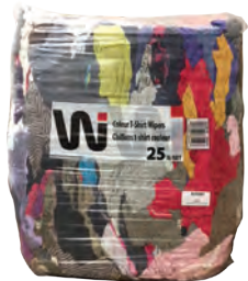
Bag of Rags 25 lbs BX-25C $29 99