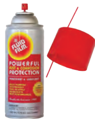
Fluid Film #3300 $14 99