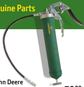
John Deere Grease Gun TY26517 $59 99