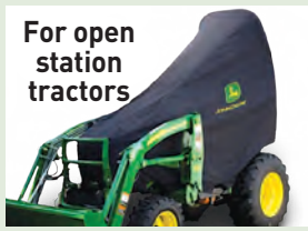
Compact Tractor Cover LP95637 $249 99 1, 2, and 3 Series