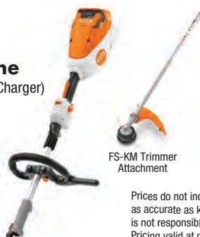
FS-KM Trimmer Attachment

Versatile, Powerful, and Quiet for All Your Yard Needs